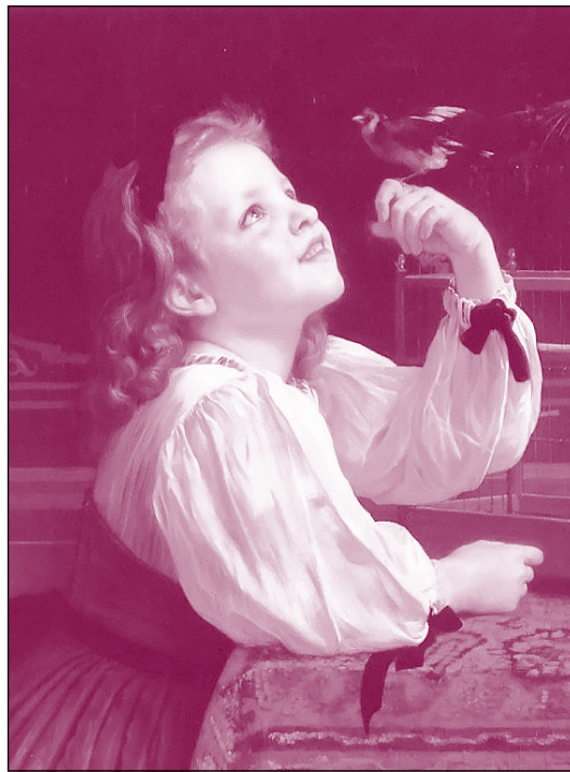
Dear Bird by Bouguereau

St. Thomas speaks of fortitude in these terms: "Fortitude denotes a certain firmness of mind...and this firmness of mind is required in both doing good and in enduring evil, especially with regards to goods or evils that are difficult." 10 The poor melancholic must persevere even if she experiences rejection, isolation or even violence. No one will ever regret virtuous and faithful actions, but everyone is harmed by the cowardly choices in life. It is essential for the melancholic, when making challenging choices (which she instinctively abhors because they may bring "rejection"), not to concentrate on it being a good choice for herself, for she often sees her own self worth as not meriting a defense. Instead it is best that she remember that it is objectively the loving and supportive thing to do for her spouse, child or friend.