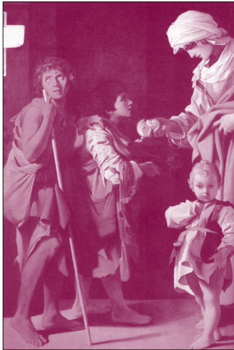
The Charity by Bartolomeo Schedoni

In this article, I shall be focusing on the melancholic soul. More often than not, among traditional Catholics, there tend to be higher numbers of pure melancholics. My own pastoral experience would indicate that more women exhibit melancholic temperaments than men in this environment. Some have an admixture of melancholic-sanguine or sanguine-melancholic, but generally there are many prone toward features of the melancholic understanding of self.