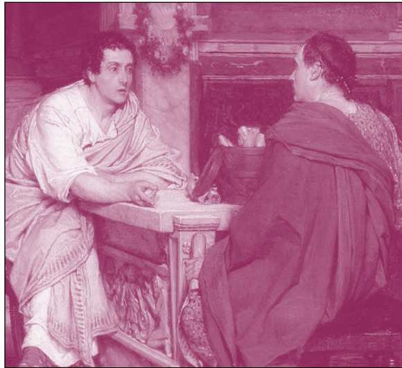
The Discourse by Lawrence Alma-Tadema

cholic: the Redemption, the Love of God and God's Love of man, the beauty of the soul and the mercy of God. For example, it is easy for the melancholic to believe that Our Lord came to redeem the human race, and she sees that her soul happens to be a member of that race and therefore will somehow be redeemed. This is an inappropriate mode of understanding; rather she must concentrate on the fact that even if she were the only soul in existence, even if ugly in her own eyes, the tender Lord would have come just for her, and would have suffered all and died out of His unconditional compassion for His individual creature so hungry to be the beloved of someone, to impart a sense of wholeness or to end her solitude. The melancholic soul