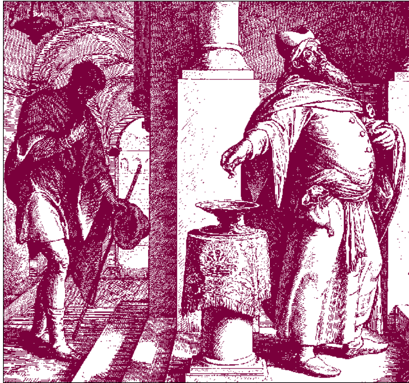
The Pharisee and Tax Collector by Julius Schnoor von Carolsfeld

with our own eyes. Then Our Lord lifts us up in our humility and consoles us in our pain. We launch out toward Divine love when we begin seeing ourselves as pathetic, not excellent observants of the Law.