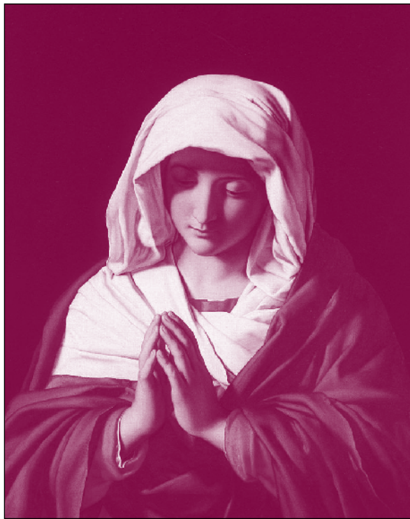
The Virgin in Prayer by Sassoferrato

In short, without prayer and meditation as a priority (even above the Rosary), 17 the melancholic will not be able to advance along the way of internal peace, or to progress upon the road of