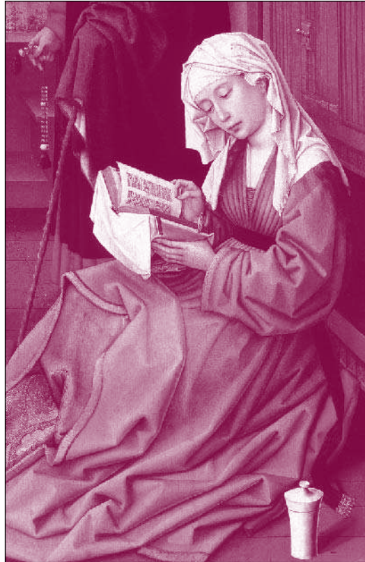
The Magdalene Reading by Rogier van der Weyden

By means of these virtues and methods he can truly begin to know the self as small and powerless, but beloved by God – Who came to die on an infamous gibbet even for the choleric soul. ✠