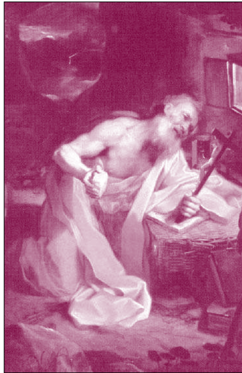
Saint Jerome by Federico Fiori Barocci

I recommend The Imitation of Christ , and the ascetical works of Saint Alphonsus Liguori, for the choleric soul. She needs to hear and acknowledge her defects and pride as personal sins to be attributed to her own volition. The devil is usually the scapegoat for the choleric. Abba observes in the Sayings of the Fathers of the Desert that